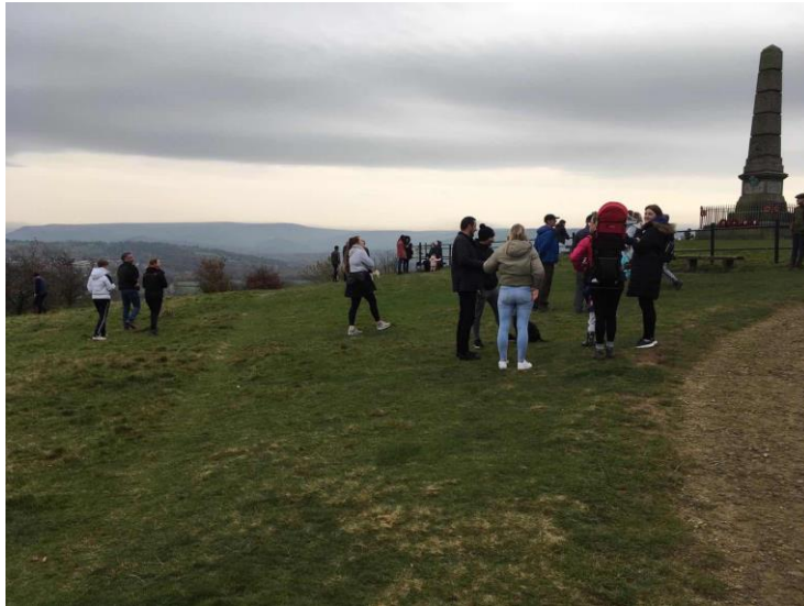
Cenotaph on Remembrance Sunday 2020